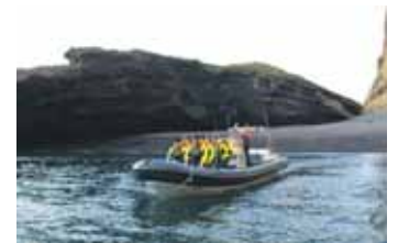
We will take land in two islands.