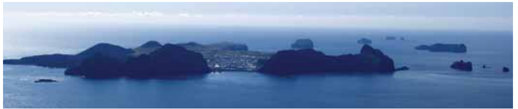
The Westman Islands.

WE DRIVE FROM THE HOTEL IN A FOUR WHEEL DRIVE JEEP OR IN A SMALL BUS WITH AN EXPERIENCED LOCAL GUIDE. TAKE THE FERRY HERJÓLFUR TO THE WESTMAN ISLANDS AND THEN HAVE A GUIDED TOUR AND A BOAT TRIP AROUND THE ISLANDS.