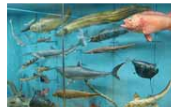
The aquarium.