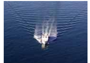
The ferry Herjólfur.