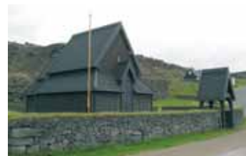
The Scandinavian church.