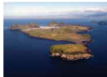
Westman Islands.