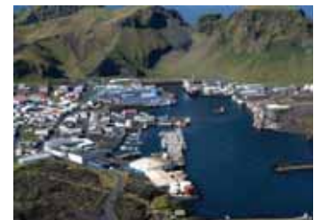
The harbour at Westman Islands.