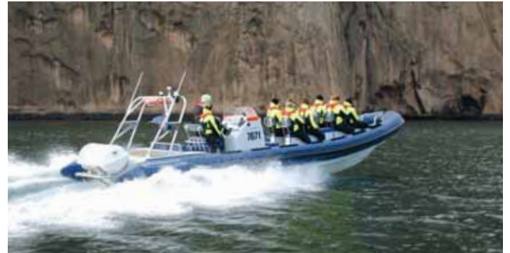
Tour around Westman Islands with Ribsafari included.