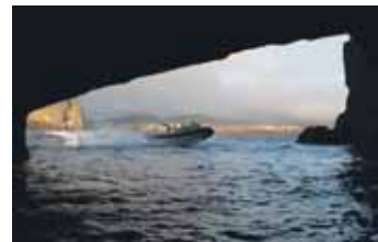
A cave in the Westman Islands.