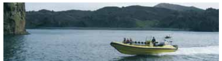
The Ribsafari boat.