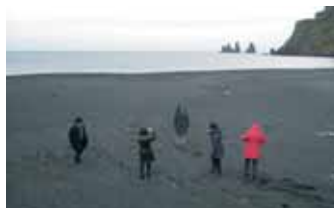
Black beaches near Vik.