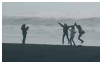
Black beaches near Vik.