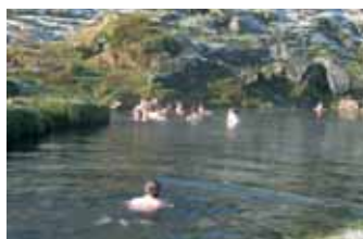
At Landmannalaugar.