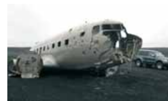
DC-3 on the coast.

The tourist guides that are guiding for Iceland South Coast Travel are members at the Iceland Tourist Guide Association.