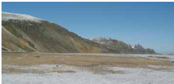
Landmannalaugar, Fjallabak.

This schedule is only a suggestion which can be changed according to your ideas and interests.