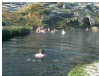
At Landmannalaugar.