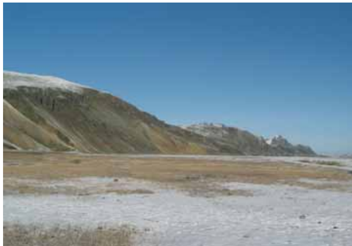
Landmannalaugar, Fjallabak.

This schedule is only a suggestion which can be changed according to your ideas and interests.