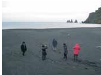
Black beaches near Vik.